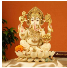
Murti/Statue or Picture of Hindu God