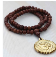
Rudraksha Prayer beads