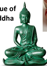
Statue of Buddha