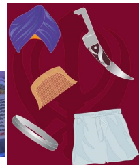
The 5 Ks — Kesh, Kara, Kirpan, Kercha and Kangha