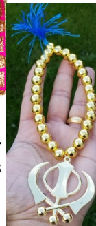
Mala Prayer beads