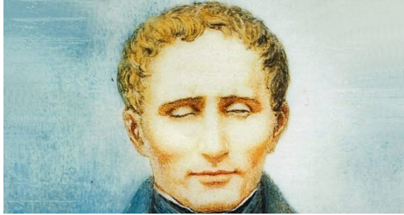
Louis Braille was a famous inventor.