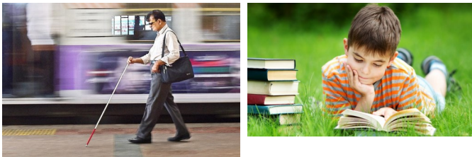
He invented Braille to help people who are blind be able to read.