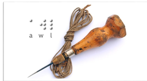
Louis Braille became blind by accidentally hurting his eyes with a sharp tool called an awl .